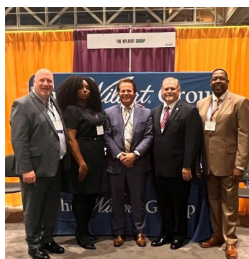
NFDMA Convention See more on page 2