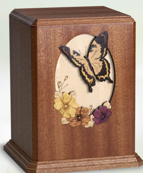
Butterfly Urn P3038