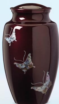
Purple Butterfly P2020