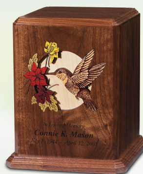
Hummingbird Urn P3017

Give your families unique choices with Wilbert's spring themed urns in both wood and metal.